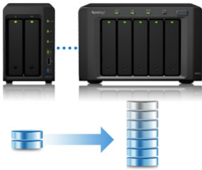
Figure 1) Flexible Scalability

DS713+ can expand its capacity on the fly and enlarge volumes across its expansion unit for storage or backup.