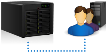
Figure 1) Enterprise Interoperability

DS2413+ fits seamlessly into enterprise domains by utilizing existing user credentials.